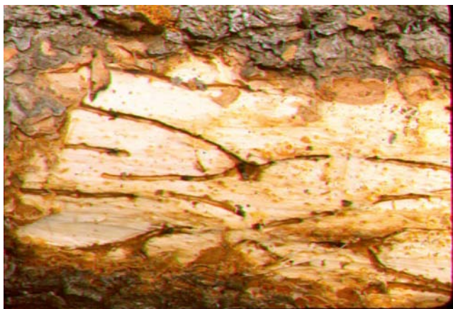
Pine Engraver egg gallery

The female beetle lays her eggs in niches cut in the side of the gallery. The eggs hatch in 4-14 days. The larvae mine laterally from the egg gallery for 1 or 2 inches, feeding for 10-20 days. When fully developed each larva pupates,