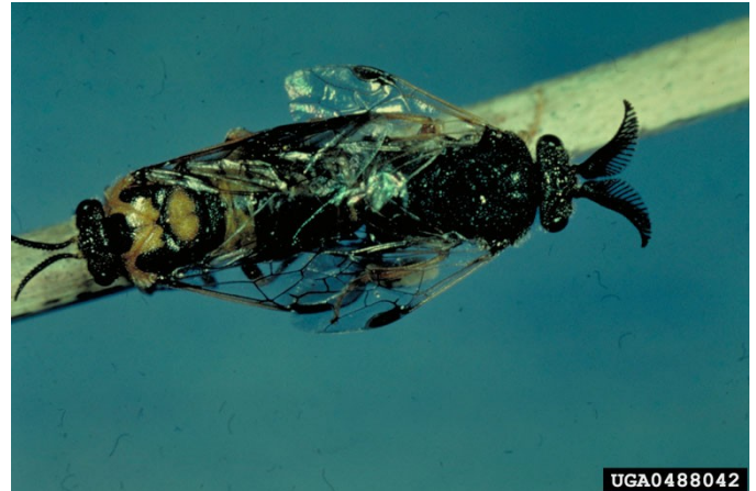
Figure 5. Mating conifer sawflies. Compare the antennae of the female (left) with the feathery antennae on the male (right).

caterpillars have 5 or fewer pairs (Figure 4). Adults are non-stinging wasps that do not feed, and are rarely observed. Males have feathery antennae, while female antennae are toothed (Figure 5).