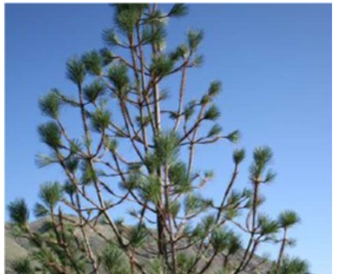
Figure 6. Damage to older needles of ponderosa pine, leaving new growth at the ends of branches.

Since most pine feeding sawflies prefer to feed on older growth needles, trees are not often killed by sawfly feeding alone. Their preference for the previous year's growth causes distinctive damage on trees. Older needles will be consumed and only the new growth at the end of the limb remains. This type of injury is called "lion-tailing" (Figure 6).