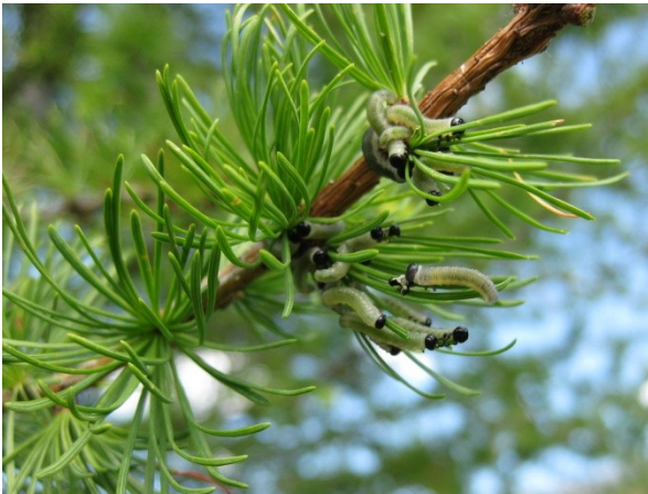
Figure 1. Sawfly larvae feeding on western larch foliage.

Sawflies are a diverse group of insects that feed on the foliage of trees and shrubs. Sawflies are plant feeding insects in the order Hymenoptera, related to horntail wasps (wood borers), bees and ants. Sawflies that feed on conifers can cause serious, but localized defoliation of trees, especially in plantations. In Idaho, several different species of sawflies from two different families feed on pines, hemlock, spruce, fir, and larch (Figure 1).