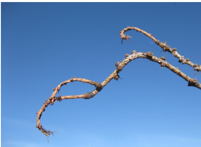
Figure 7. Damage to larch branches from sawfly oviposition.

The larch sawfly causes a characteristic curling of the new growth when it lays its eggs. Because larch foliage is shed in the fall, larch sawfly females lay eggs into the current year's shoot growth (Figure 7).