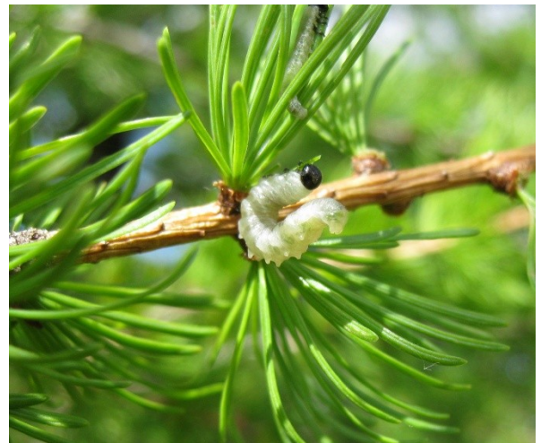
Figure 3. Defensive or alarm posture of a larch sawfly larva.

Most sawflies only have one generation per year. Females lay eggs inside the needles or shoots of their host plant using their saw-like ovipositor (giving this group its common