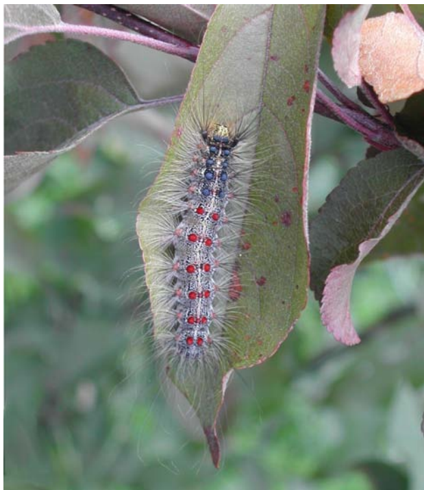
Figure 2. Full grown gypsy moth caterpillar.