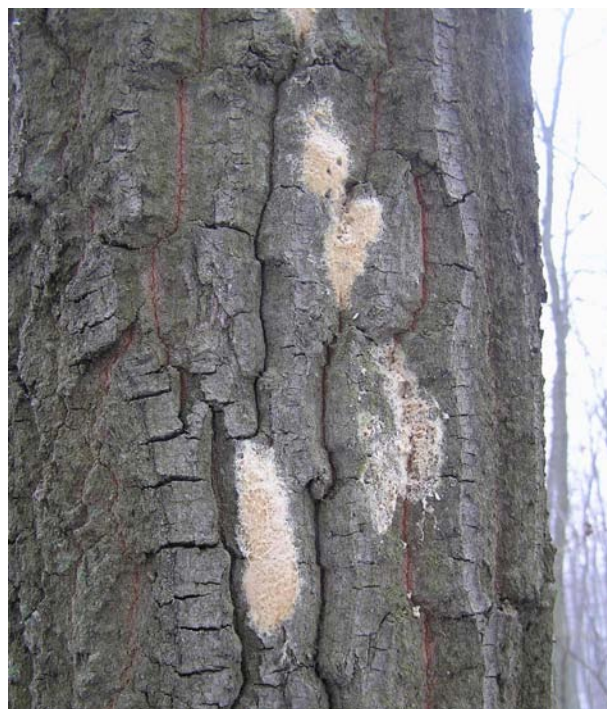
Figure 1. Gypsy moth egg mass.

Tree species not favored by the gypsy moth include ash, true firs, cottonwood, catalpa, cedar, dogwood, sycamore, rhododendron, and tulip poplar.