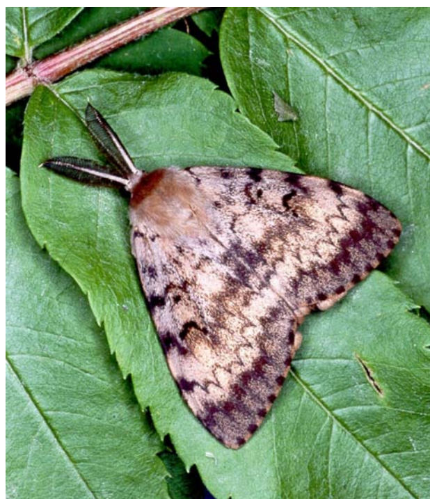
Figure 5. Gypsy moth male.