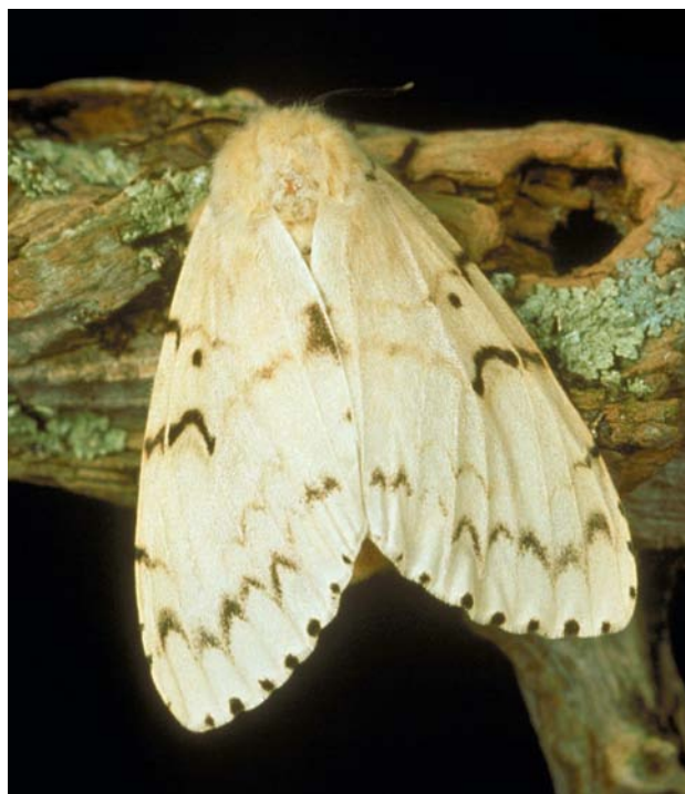
Figure 4. Gypsy moth female.