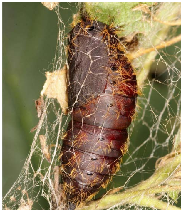
Figure 3. Gypsy moth pupa.